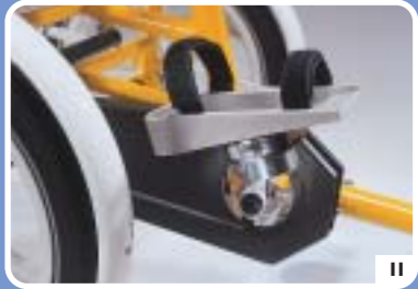
Velcro footplates (small model)