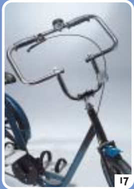
rectangular steering wheel (large model)