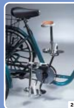
footplate with legclamps

The table below gives you a full overview of the various models, including detailed specifications and information about the available colours and options.