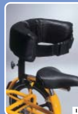
broad hip support with belt