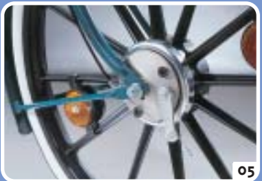
drum brake, built into the front wheel axle