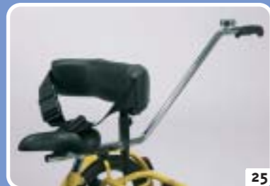
accompanying bar with hip support and belt