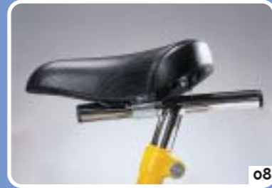
T-shaped saddle pin